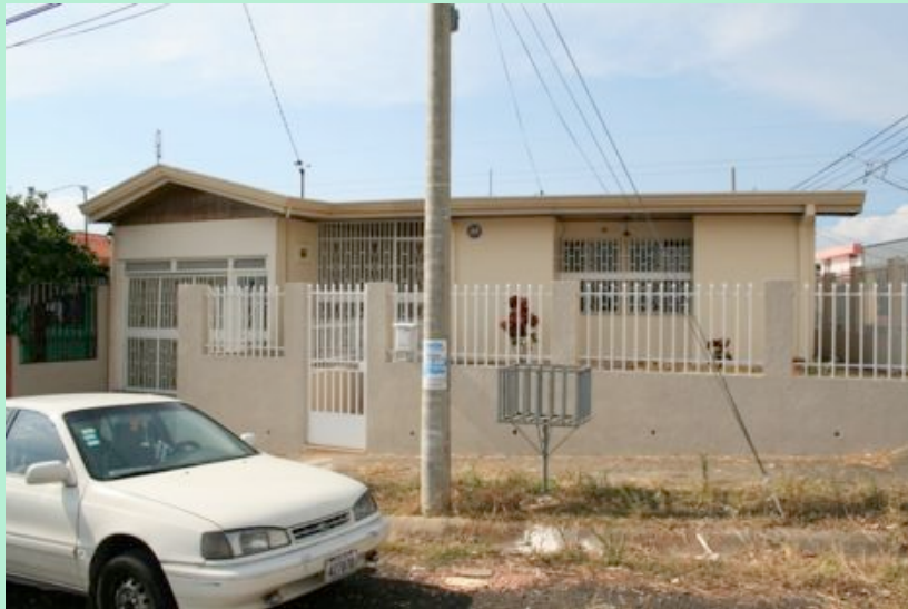
Central American Headquarters