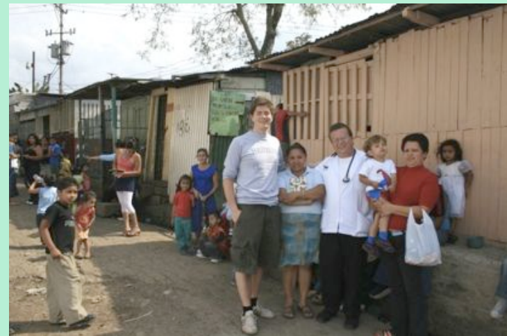
First Student and Medical Staff