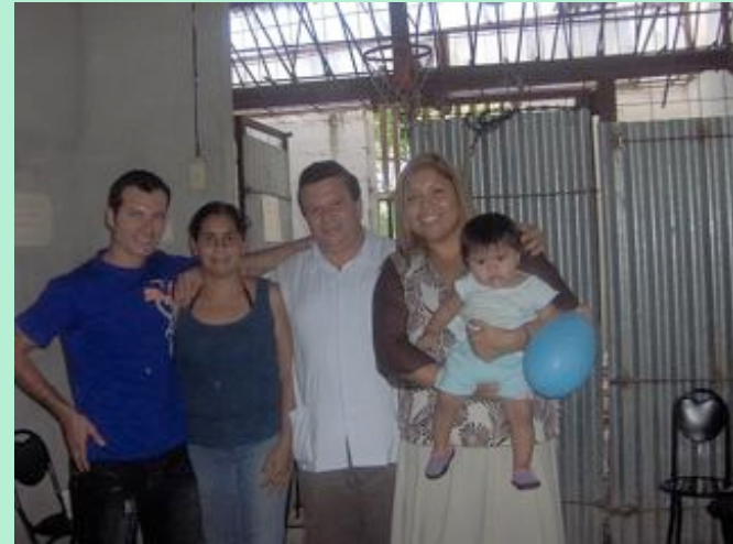
Local Medical Staff and Barrio Mayor